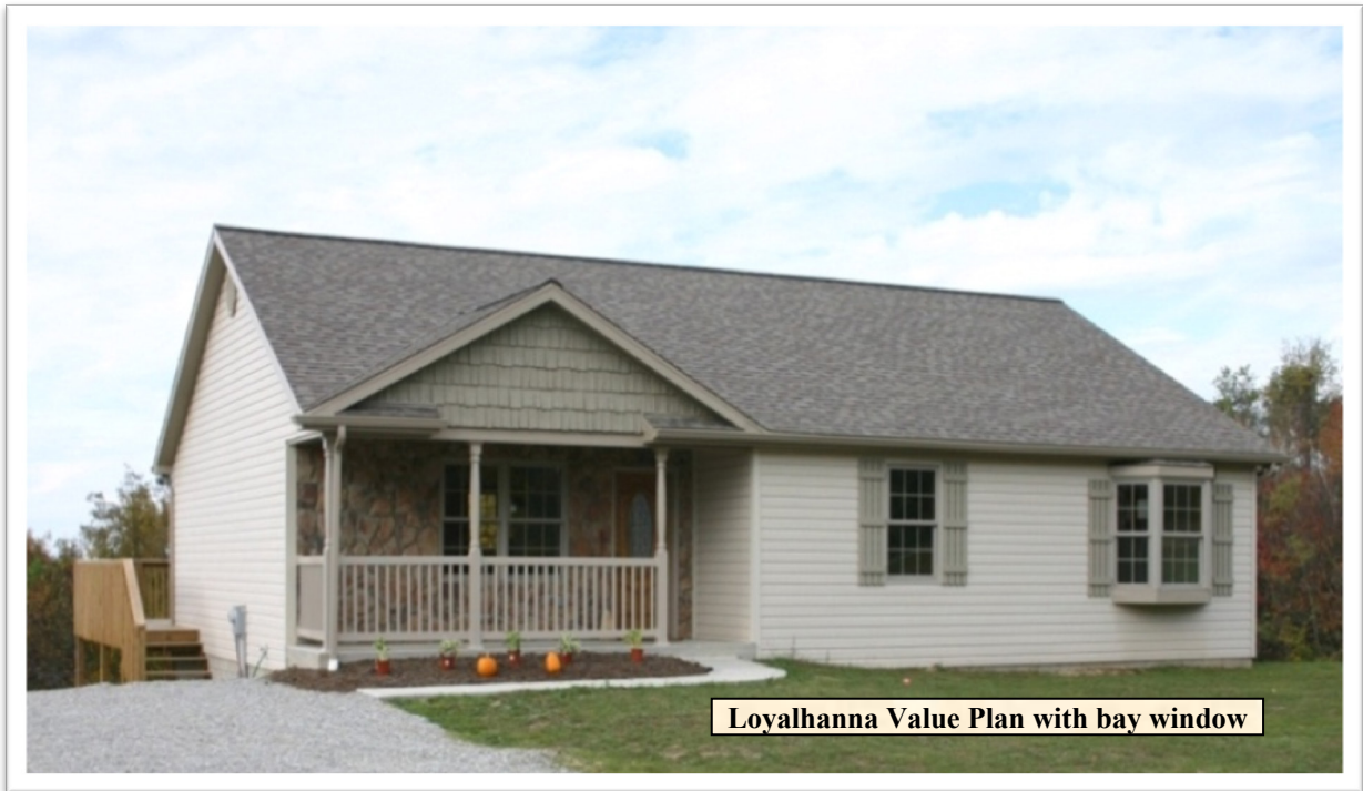
Loyalhanna Value Plan with bay window