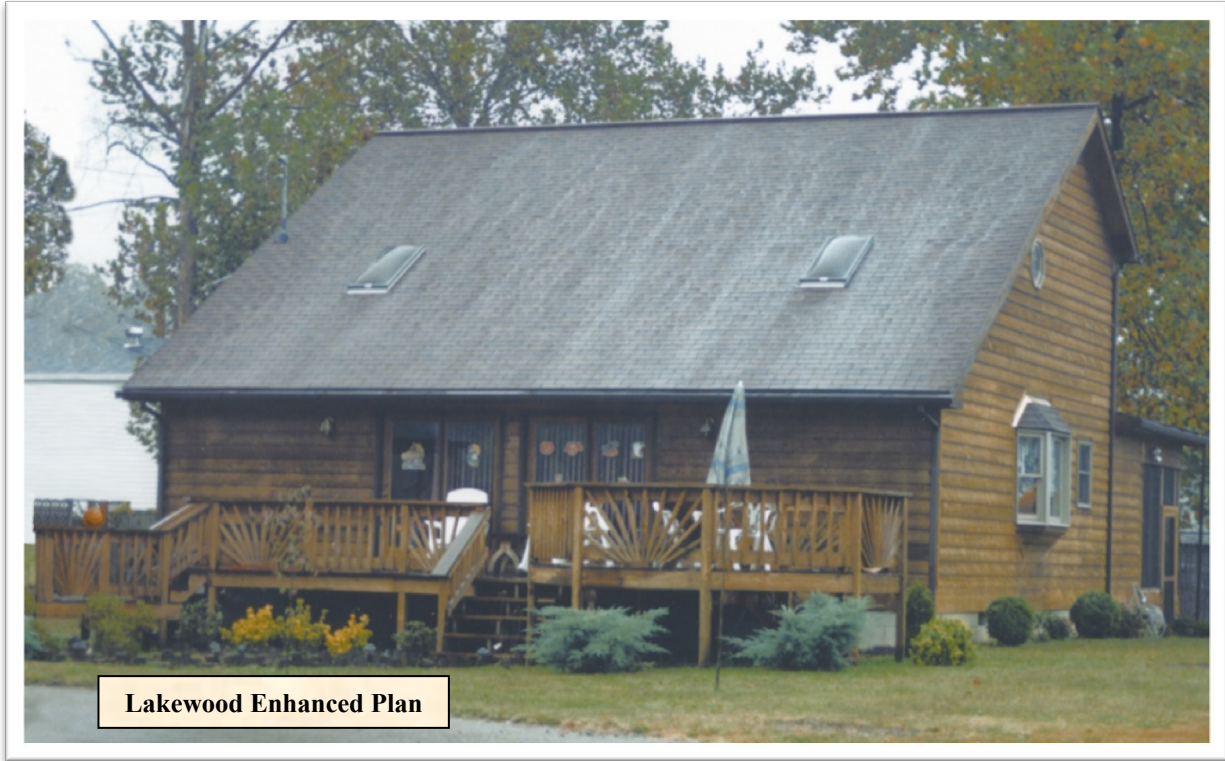
Lakewood Enhanced Plan