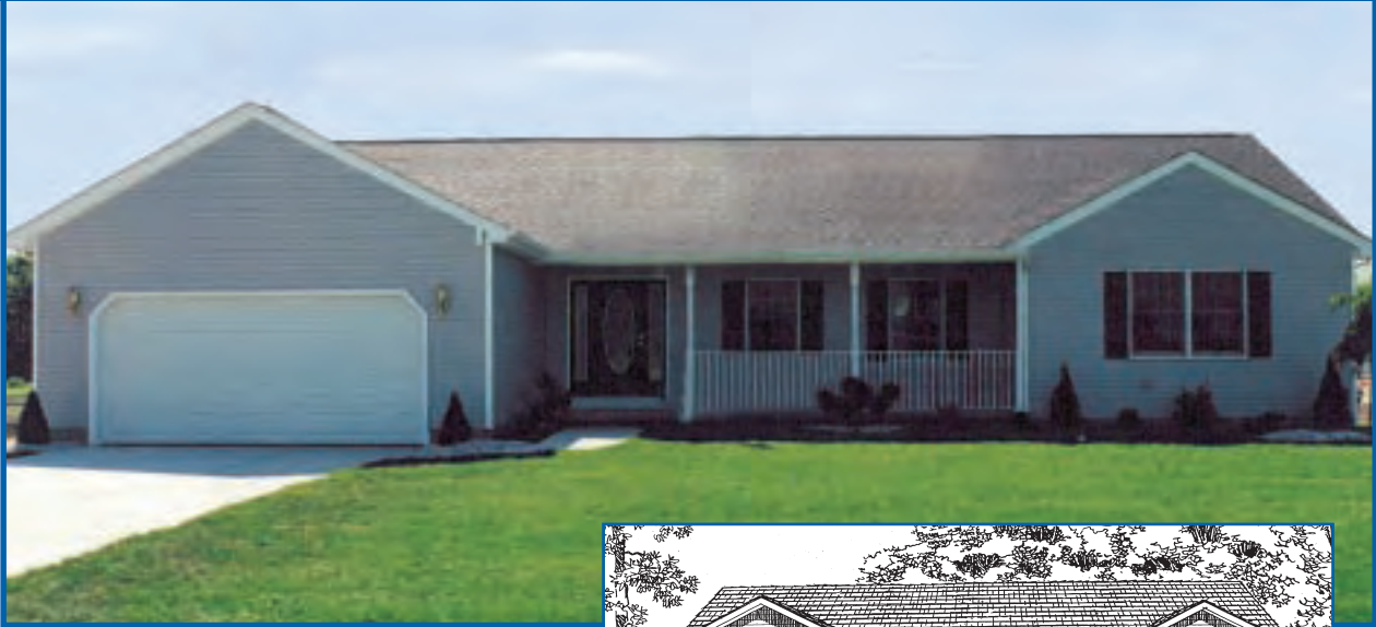
Photo or artist rendering may vary from actual plan.