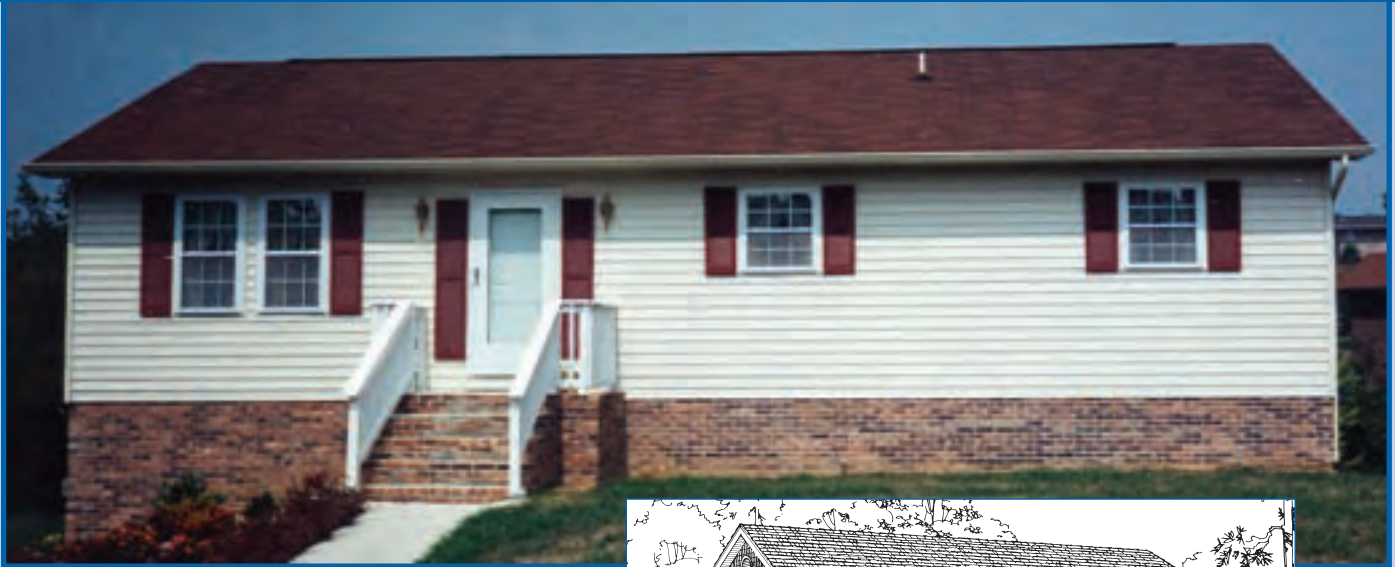
Photo or artist rendering may vary from actual plan.